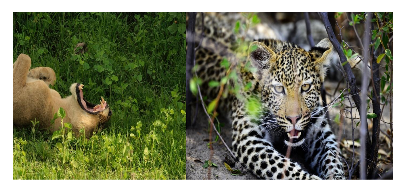
DAY 5: Early breakfast followed by a transfer leading to Maun for a drop off.