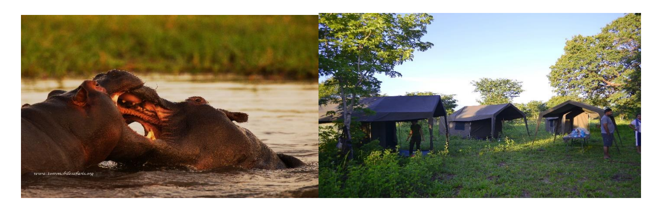
Day 2 : Breakfast will be served in the morning before transfer to Savuti. Game drive will be around the park where you are likely to spot meat lovers and other animals like buffalos, impalas, zebra and kudus. Lunch will be served at the camp. After lunch time have a quick shower and rest. An afternoon game drive will follow in which you will view a perfect sunset. After nights and dinner will be served at the camp.

Day 1 : Pick-up by our tour guide from the airport. Have a short time for shopping at kasane hunter's mall. A boat cruise will follow which will be done on the Chobe River. You will have the opportunity to view different animal species like elephants swimming in the river, giraffes, hippopotamus and different kind of birds. After a boat cruise lunch will be served at one of the local restaurant where you can have our local dish. A game drive will follow in the Chobe national park leading to the camp site where you will be accommodated. Your accommodation will be mobile tents. Dinner will be served on the camp.